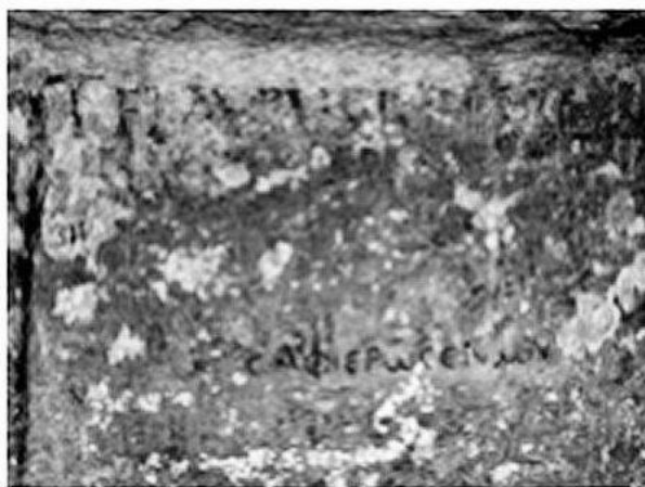
Συναγωγή Μαρκιωνιστών κωμ(ης) Λεβαβών του κυρίου και σω(τη)ρ(ος) Ιη(σου) Χρηστού προνοια(ι) Παύλου πρεσβ(υτερου) -- του λχ' ετους.

The plaque is dated 318 A.D. and reads "The Lord and Saviour Jesus, the Good" and is the earliest mention of Jesus in recorded history (Le Bas and Waddington, Inscriptions, No. 2558, vol. iii. p. 583) and more ancient than any dated inscription belonging to a Catholic church.